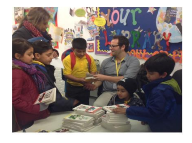
Year 6 hard at work!