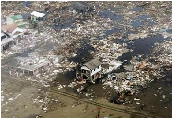
Sumatra, Indonesia 2004 – 227,898 deaths

Not all earthquakes have the same effect. It depends where the earthquake happens and how strong it is. Some countries are better prepared for earthquakes than other.