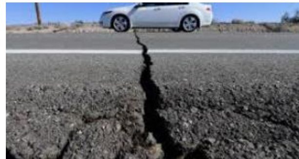
California 2020- no deaths